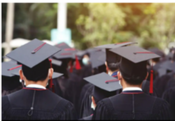
NEW GRAD GUIDE