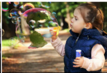
PARENT SUPPORT GUIDE